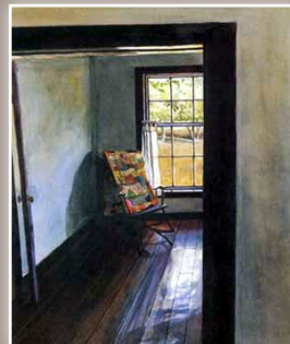
Simple Pleasures framed - $125