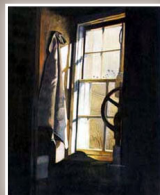
Timeless Tradition framed - $85