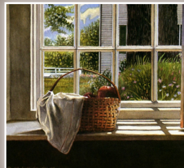
Summer Reflections framed - $125