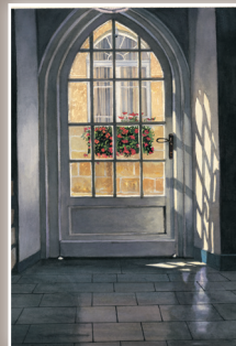
Sanctuary framed - $125