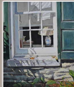
Heritage framed - $125

Use this card for $10 off any signed print OR $20 off any original watercolor!